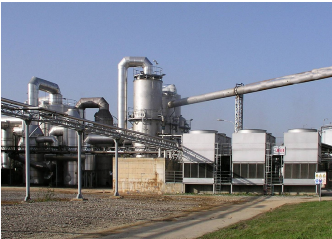
Pic. 2: Complete revamped Sulphuric Acid DC-Plant (600 tpd) with PINC™