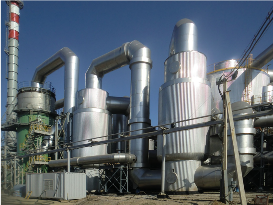
Pic. 1: 2,000 tpd Sulphuric Acid DC-Plant based on sulphur burning with PINC™