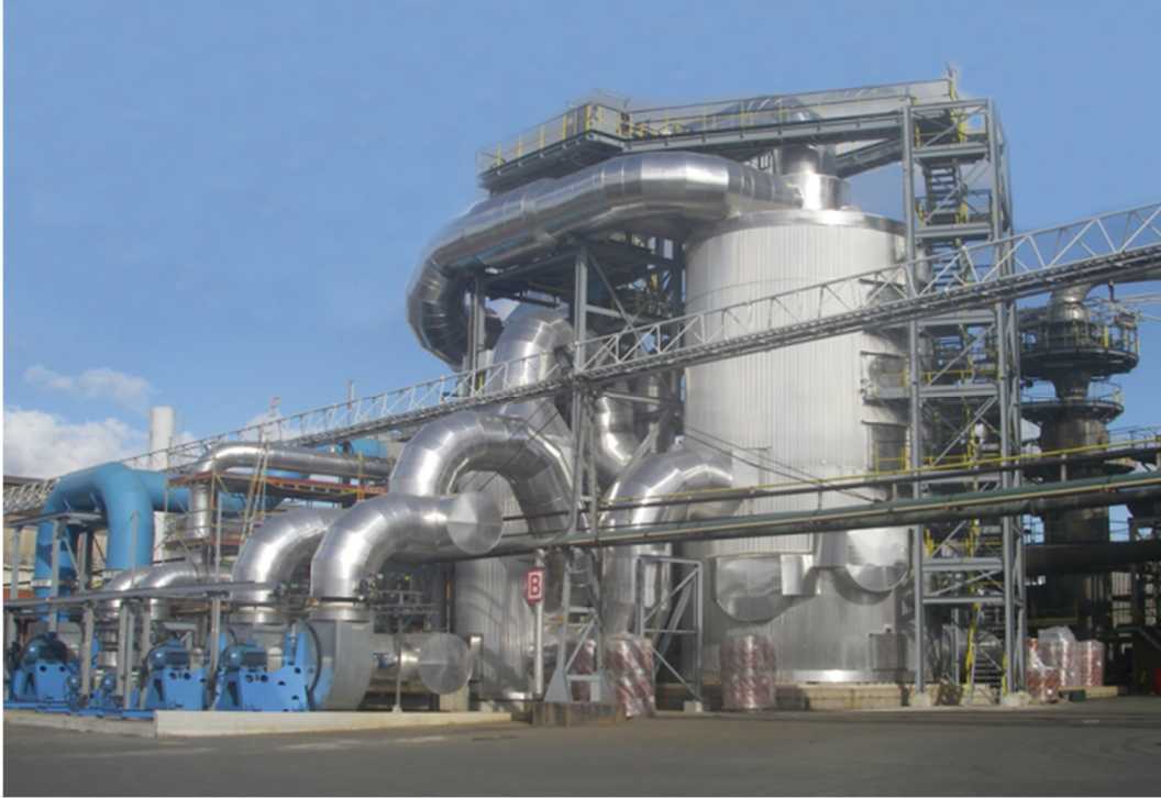
Pic. 3: Wet-Gas-Cleaning Plant down a Mo-roasting plant PINC™