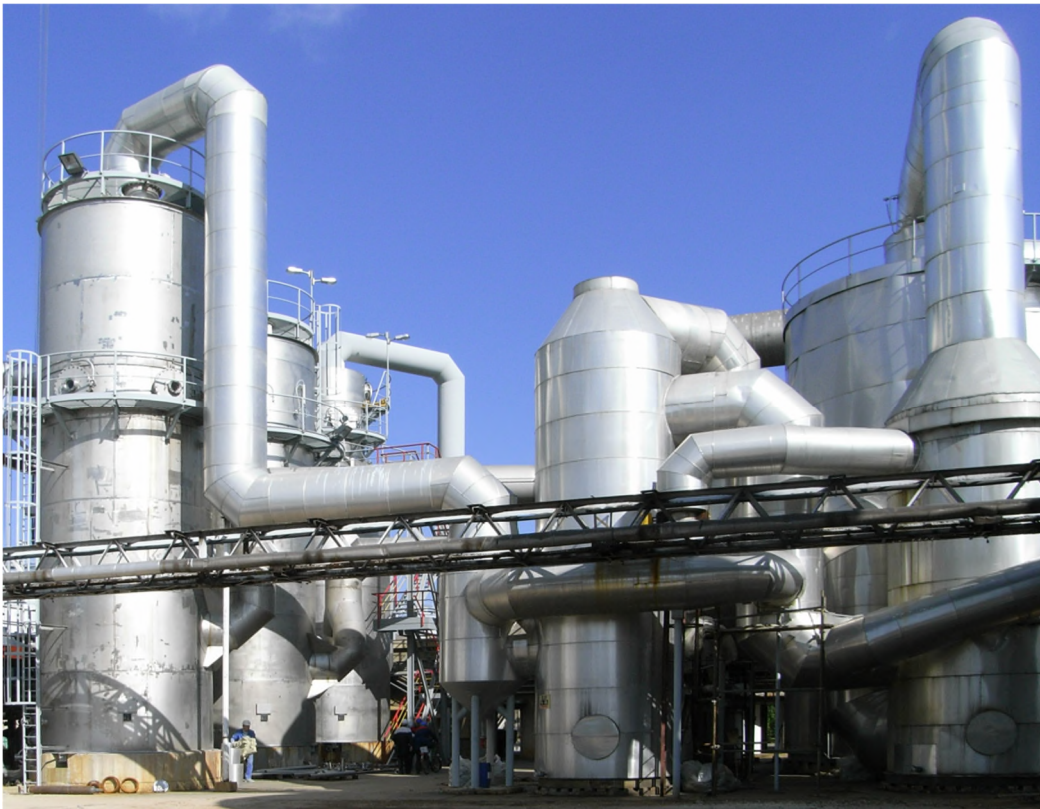
Pic. 4: S-Burning-Plant 740 tpd Mh based on PINC™